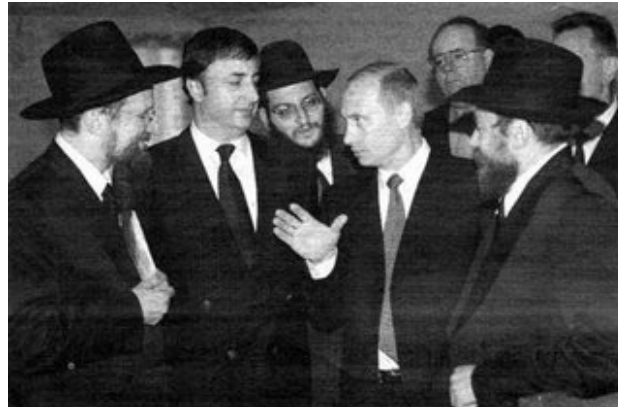
Russia - President Vladimir Putin